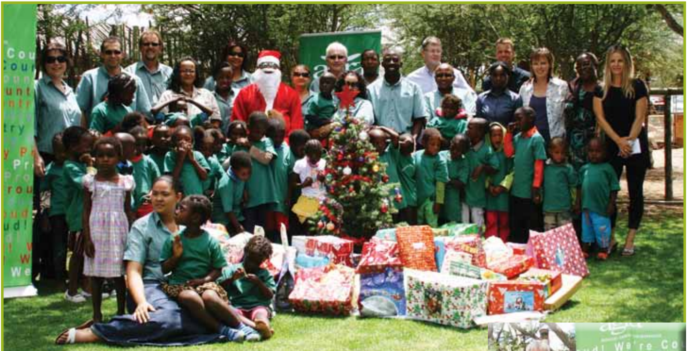
Songs, laughter, food, a Santa Claus and lots of gifts – brought by Agra staff for children of Havana Soup Kitchen at the Haven Zoological park.

Agra staff members in Windhoek once again contributed very generously to Havana Soup Kitchen, the current beneficiary of the Agra/PMK social project. On Thursday, 8 December, 41 kids of this organisation were taken on a bus trip through Windhoek and entertained with a tour and picnic at the Haven Zoological Park. There, Santa Claus handed over Christmas gifts, donated by Agra head office staff, to everyone.